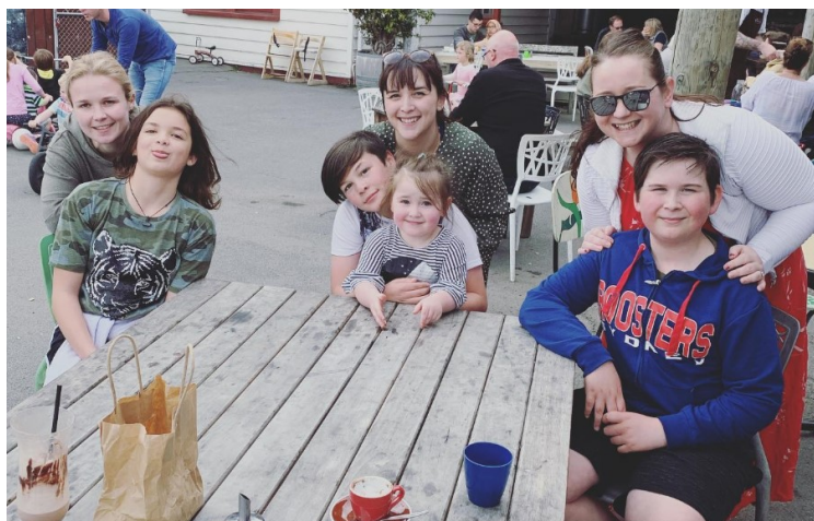
Left: During their time at HHT (2008) Above: Catching up this year.